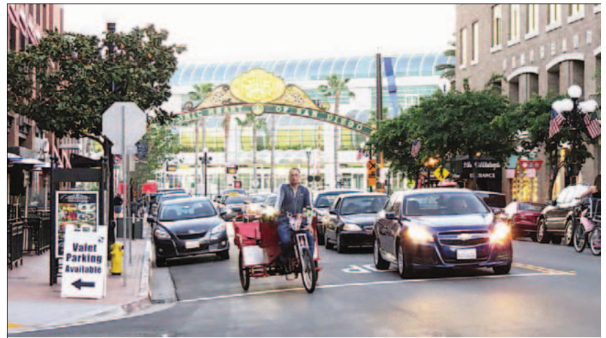
CATHY DONALDSON/TIMES & TRANSCRIPT