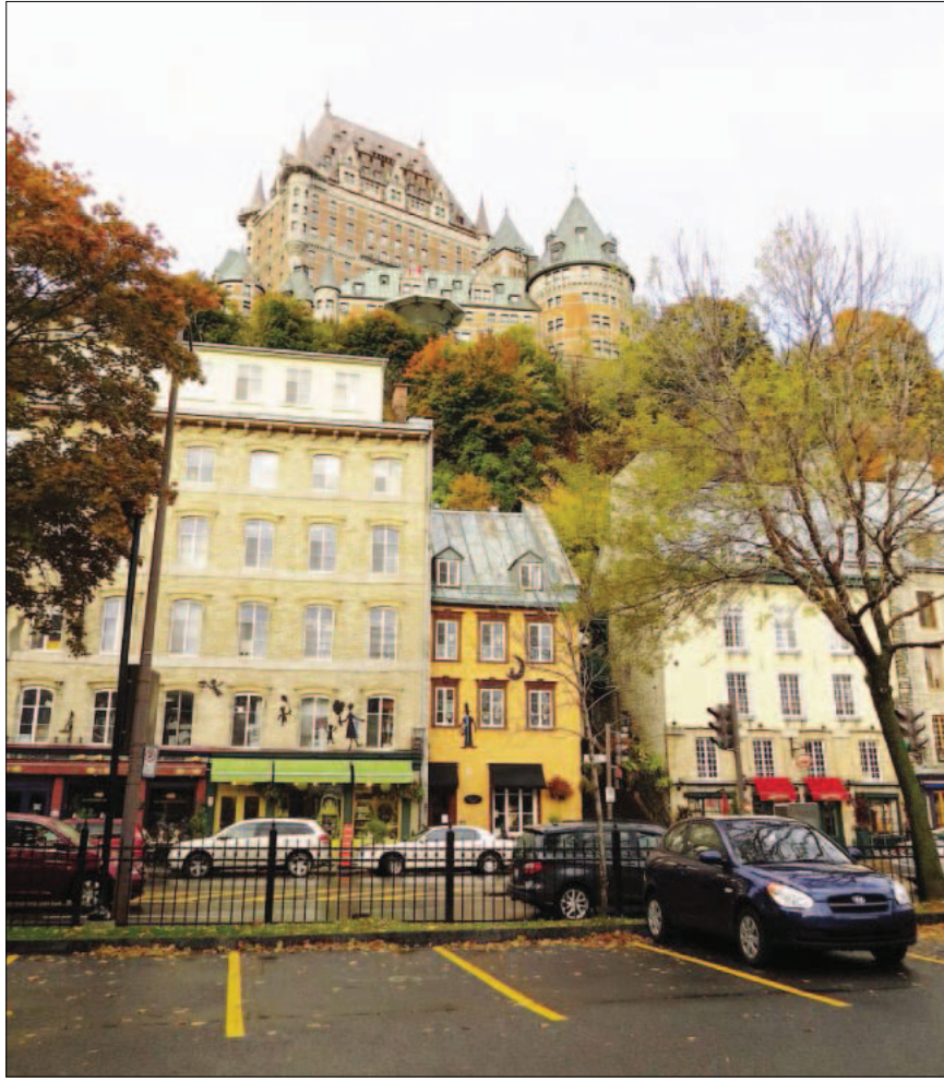
Chateau Frontenac from Champlain Boulevard, Quebec City.

After asking some foodie friends from "la belle province" which restaurant we should choose for dinner on our one-night stay, they